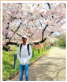
Under the cherry blossom tree

As someone with a scientific background, I've always been skeptical of luck and superstitions, often viewing them as mere coincidences. However, sometimes life surprises you in ways that feel like fate, reminding you that you can end up exactly where you need to be. One such place for me is Kyoto, Japan—an idyllic city nestled in a picturesque valley, surrounded by rolling hills and lush greenery.