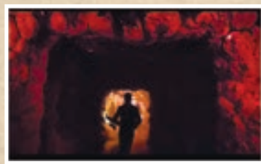
Inside the Kyoto Botanical Garden during the 100th anniversary light show event.