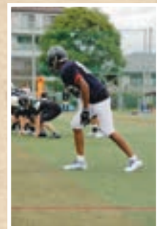
Kyoto University Football team.

One thing I truly believe is that surrounding yourself with inspiring people is key to personal growth. I find constant inspiration in the hardworking people of Japan, from my fellow researchers in the lab to the everyday individuals I encounter on the streets. The entire country, with its dedication and work ethic, encourages me to strive for excellence every day. My adventurous journey in Japan has just begun, and there is so much more to explore, learn, and experience. I am excited for the memories I will continue to make, the lessons I will learn, and the joy this journey will bring me.