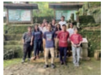
ガジャマダ大学との院生ワークショップ (2024/3/2 見学前にて) 前右から 2 人目が筆者

この活動についても、社会学を専攻していたので文学研究科のグローバル COE プログラムにたまたま誘っていただき、その流れでスーパーグローバル事業に関わったわけで、川に流されながらたまたま辿り着いたという印象です。しかし、この事業を通じてドイツのゲッティンゲン大学と交流関係を結んだり、学生を連れてドイツだけでなく、タイやインドネシアの大学と研究交流できたりしたことは、その度に新しい出会いがあり、楽しみの多いものでした。さらに、この事業をきっかけとして外国人教員を雇用することになり、そのポストが運良く定員編入されて、生物資源経済学専攻と私の研究分野の国際化が予期した以上に進展しました。これもまた、流れてきたフックに偶然に荷物を掛けるという感覚でした。