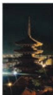
Hokan-ji (Yasaka pagoda)