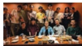
Farewell Party of the Lab