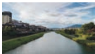
Kamo-gawa, my bike path to work

I am deeply honored and grateful to have been selected by the Graduate School/Faculty of Agriculture and feel extremely privileged to have been given the opportunity to live and work in Japan for the second time in my career. Japan is currently the country where I spent the 3 rd most time of my life (1 st being Austria, 2 nd USA as a Postdoc, 3 rd Japan as a Professor). I would not mind if Japan becomes number 2 in my personal lifetime. In German language we have the proverb aller guten Dinge sind drei ; I would be delighted if a third Japanese era would follow sometime in the future. Ookini, mata ne