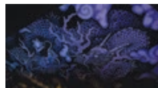
Dragon ceiling in Kennin-ji